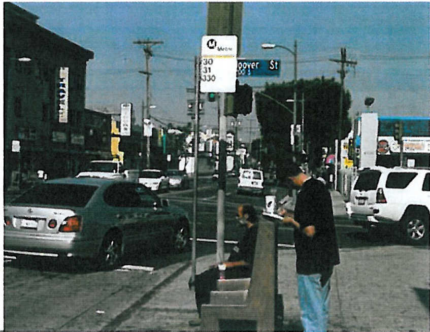
Multiple agencies maintain the bus stops in Los Angeles (below). Right: A resident of L.A. conducts a bus stop inventory as part of a grassroots transportation planning effort.